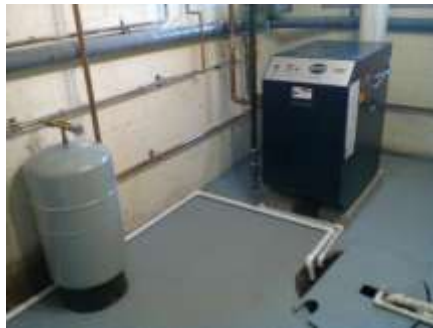
Right, a glimpse of the new boiler and a renovated room, and a cleaned and painted floor