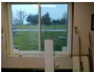
Left, office window installation—now a window with a view!