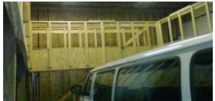
Above, walkway between the two lofts