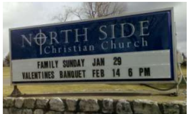
Above, have you noticed our new sign? It was replaced due to hail damage.

S.O.C. A group from S.I.S. Sisters In Service Serving Our Community