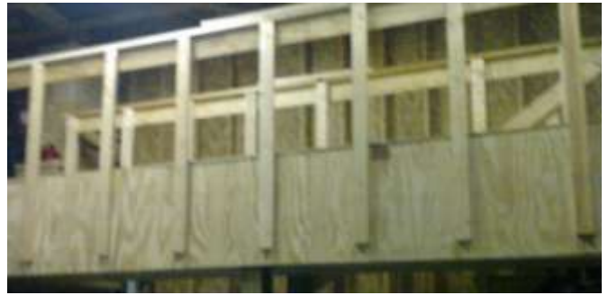
Above, new loft